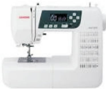
Janome Model 3160 QDC

A locally owned and operated company Since 1992