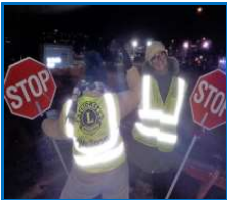
Playing on Parking Lot Patrol

... Work is second nature to Lions, but having fun while you provide community service, is what keeps Lions engaged and always wanting to come back for more!