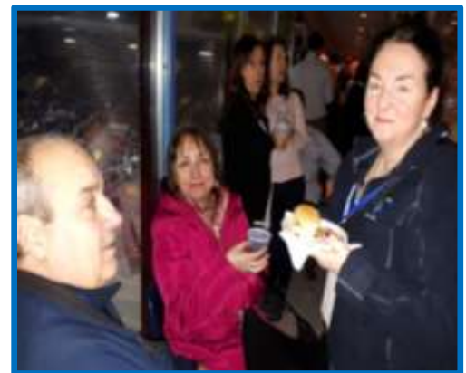
Enjoying VIP treatment at Frosty

< Watching the Wonderbolt Circus selecting parade winners >